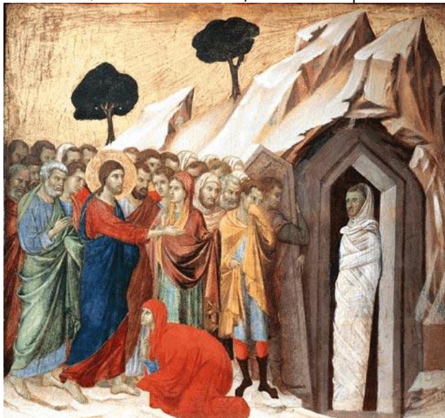
The Raising of Lazarus Duccio di Buoninsegna 1319