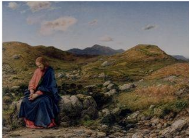
Christ as The Man of Sorrows